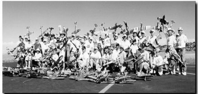
48 pilots, ready to fly, some will live and some will die!