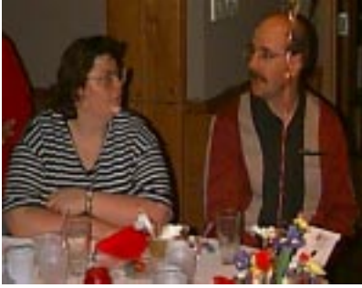
Our President, showing that he knows how to take instructions.