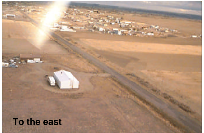
To the east