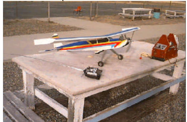
Da Plane! Da Plane... before.