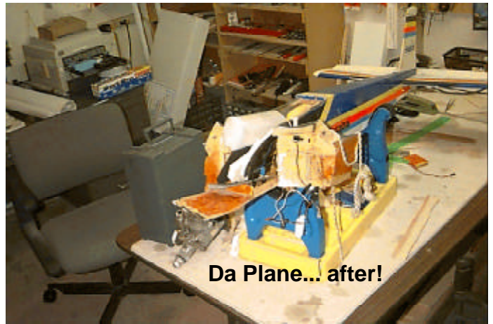
Da Plane... after!