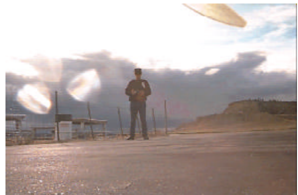
Da Man! Da Man... sorry, couldn't resist.