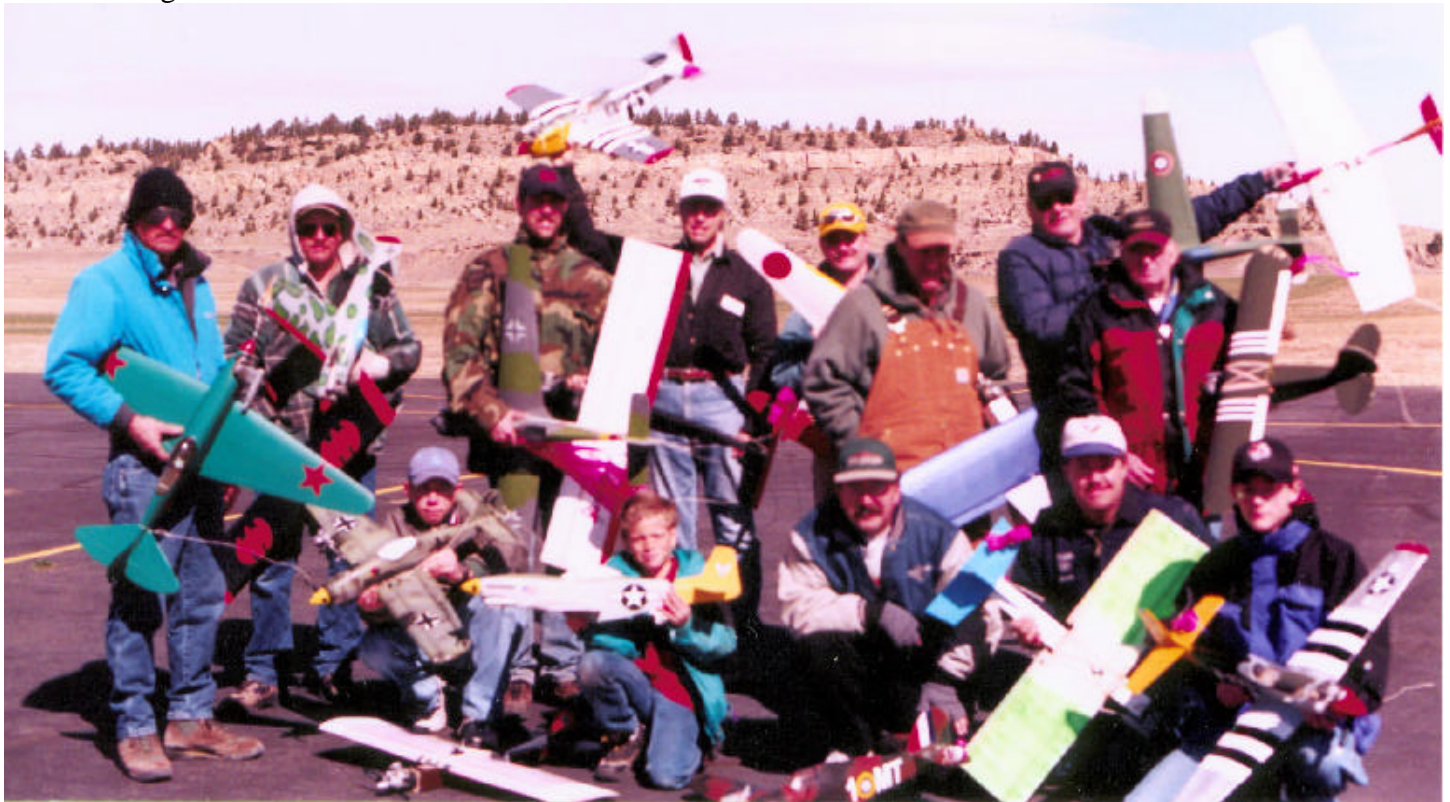
Those Magnificent Men and Their Flying Machines Combat pilots braved the cool temperatures and gusty winds for the spring combat primer held April Fools, ah... I mean April 1st. Results on Page one.