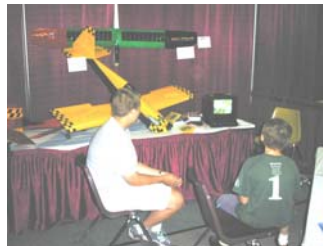
Kids and Aviation—What it's all about.